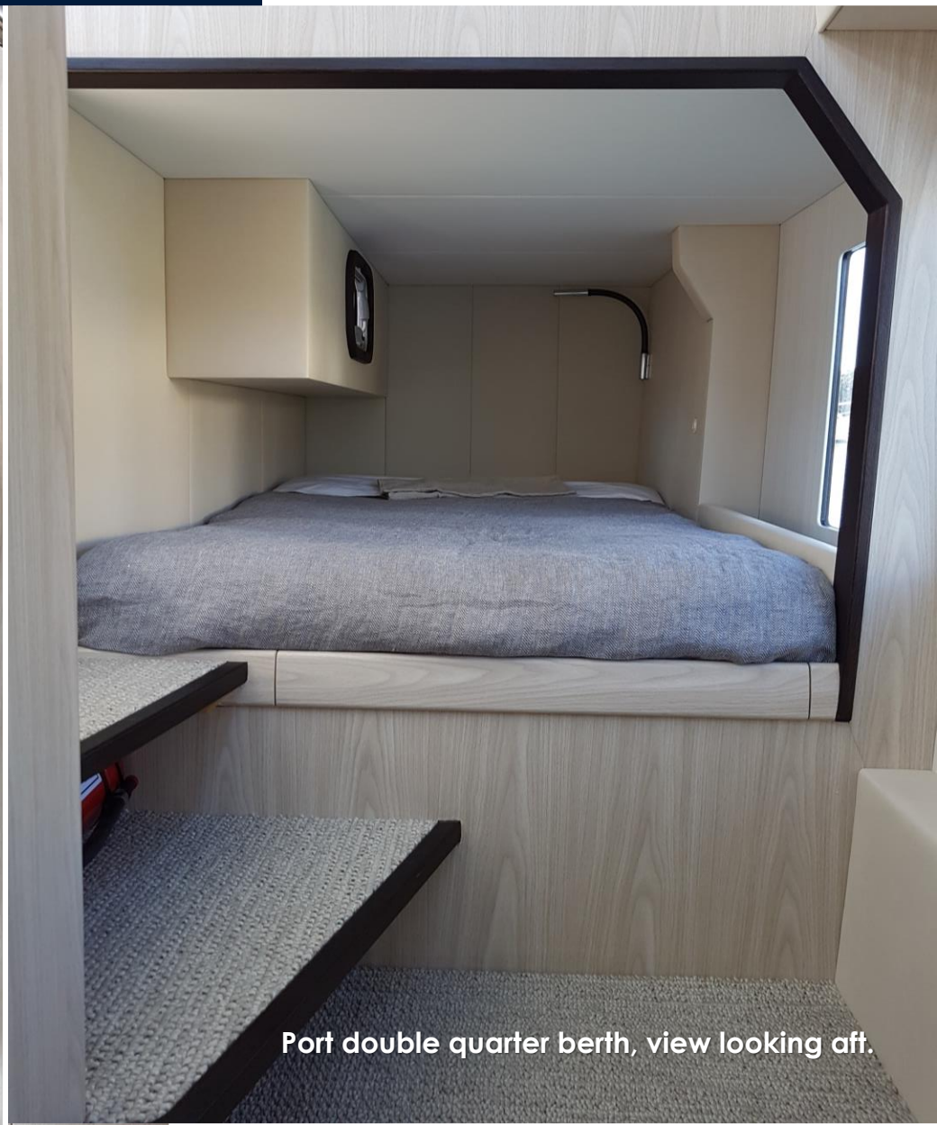
Port double quarter berth, view looking aft.