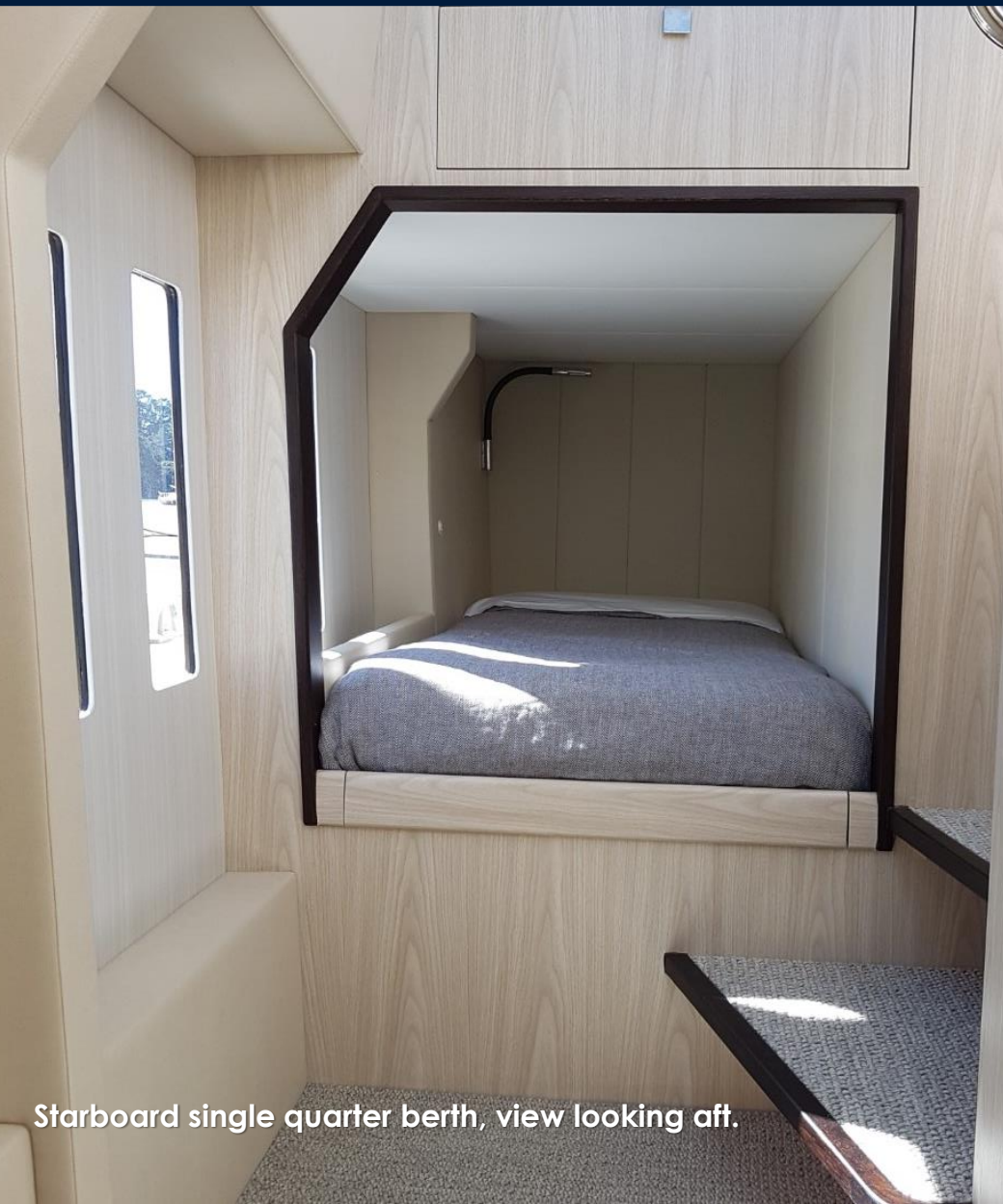
Starboard single quarter berth, view looking aft.