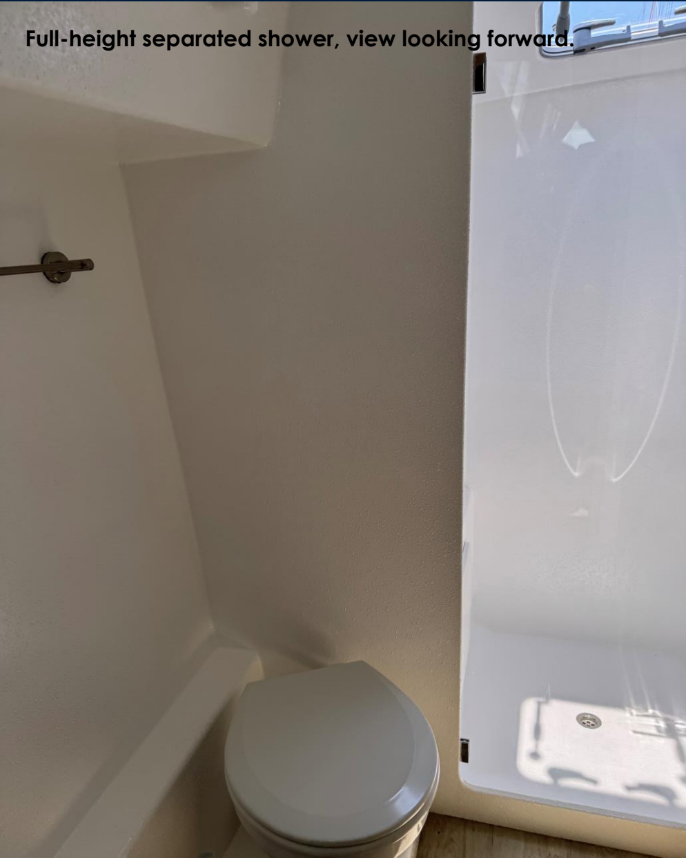
Full-height separated shower, view looking forward.